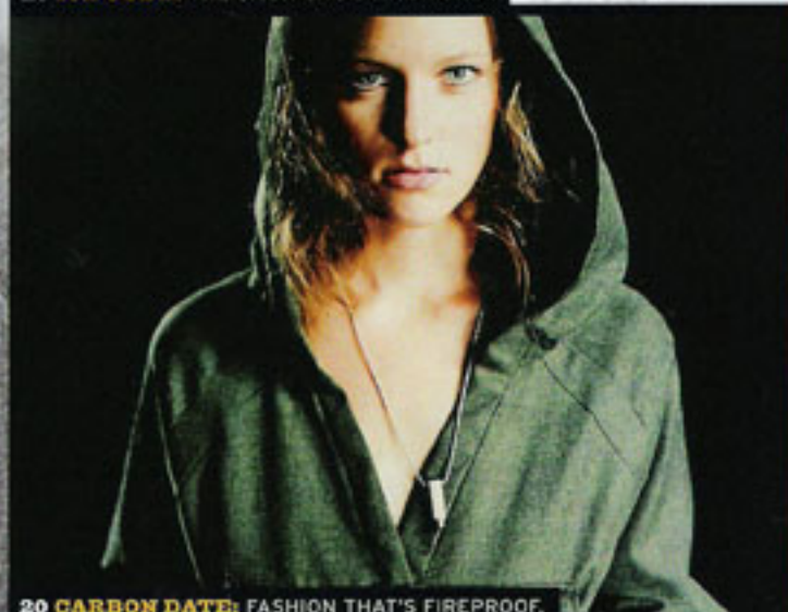
20 CARBON DATE: FASHION THAT'S FIREPROOF.